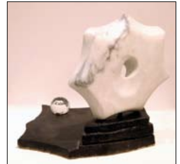
(right) Cat No. 44 "Crystal Gazer" talc on slate with crystal 22cmH $440