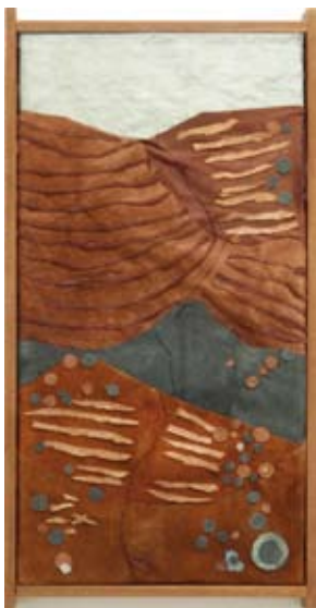
Cat No. 49 "One Road Less..." leather with bark & silk 34cmW x 67cmH $550