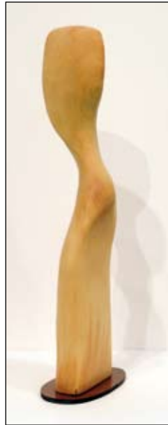
(left) Cat No. 47 "An Elegant Twist" Huon pine on perspex 38cmH $400