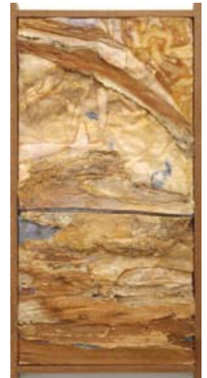
Cat No. 52 "Death of a River" silk with bark 34cmW x 67cmH $550