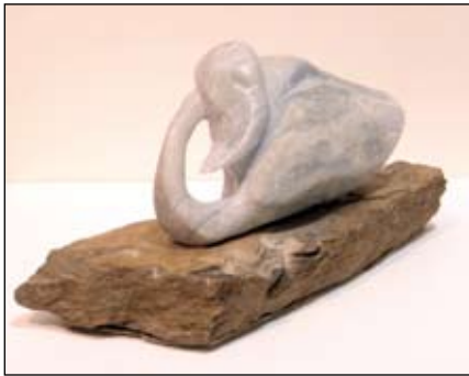
(left) Cat No. 39 "Flamingo Resting" talc on rock 15cmH $350