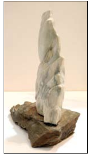
(right) Cat No. 40 "Irregular Spiral" talc on rock 30cmH $360