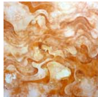
mixed media by Kathryn Hill

Samuel Schmid was born in Switzerland and migrated to Australia in 1985. His art is inspired by his love of science fiction, comics and animation. His work playfully explores the duality of micro and macrocosms and within that realm organic and technological; miniature and colossal; light and dark; hard and soft; feminine and masculine energy.