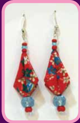
(left & right)