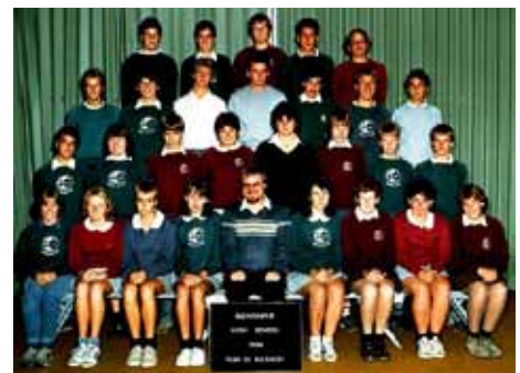
School photo (Glengowrie High 1986)