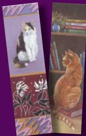
(left) various book marks $2.50 each