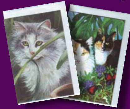
(left) greeting cards (blank inside - many designs)