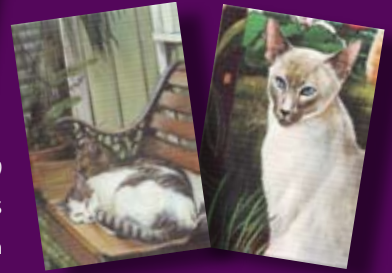
(right) gift cards