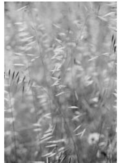
photography (film) by Janine Paris

Of course, there is a wide range of 2D paintings and drawings, including work by many well known artists.