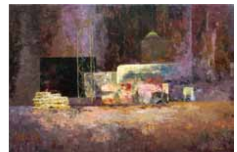
painting by Louis Ginsberg

sala FESTIVAL South Australian Living Artists AUGUST 5 - 28 2011