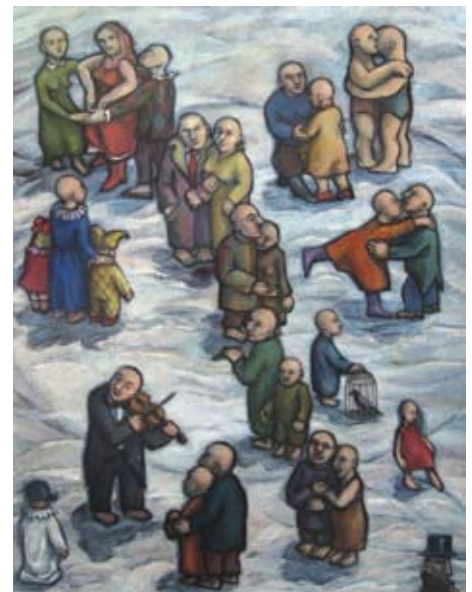
'Celebration' painting by Liza Merkalova

'Twenty Ten' exhibition opening 5-8pm, Friday 15 January