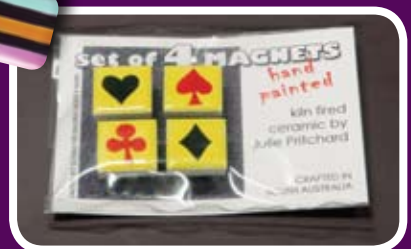
(left) Magnets featuring artworks by