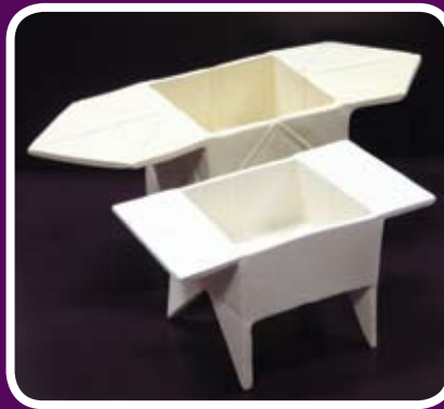
Ceramic Origami Gift Boxes by