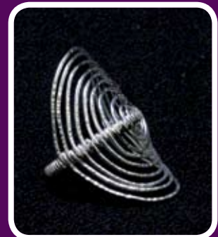
(above) pomegranite ring $115