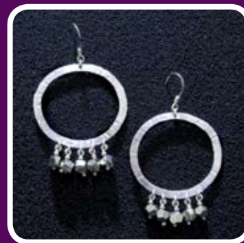
(above) silver frost earrings with satin frost hoops, and natural crystals $85

Handcrafted sterling silver creations by Eleanor James