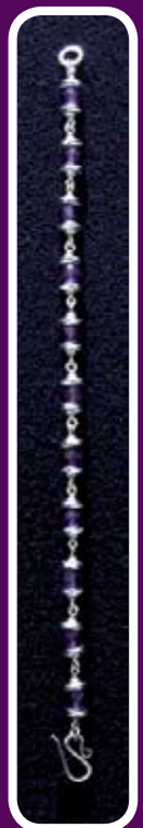
(right) amethyst bracelet $148