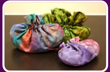
(above) handmade silk 'treasure bags' by Helen Cutting $13 each