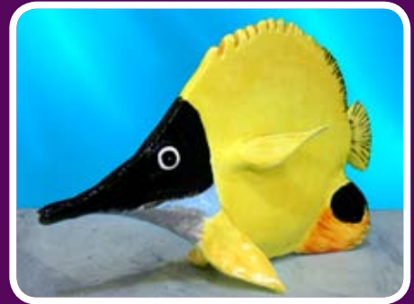
(right) Handcrafted ceramic Boar Fish, by Eileen Puschart $50