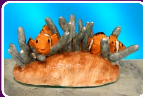
(left) Handcrafted ceramic Clown Fish, (Nemo Duo) by Eileen Puschart $45